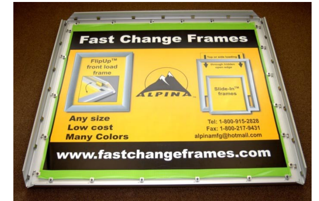
Stretched banner showing simple clamps that do all the work. Stretches out the worst wrinkles and creases. Your graphic will look like it was ironed !