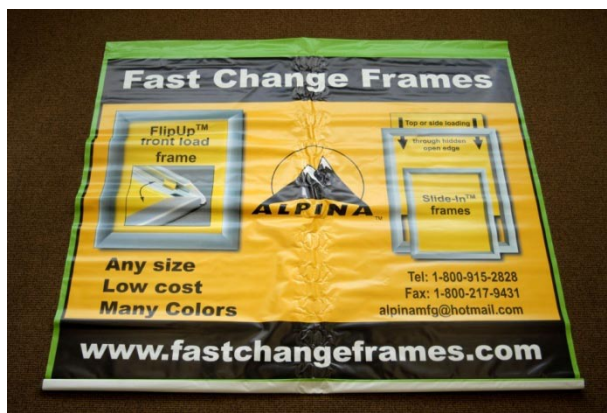
80"x 90" loose, un-stretched banner, that shows wrinkles and creases.

Takes loose banners and makes them drum-tight. Any size made fast, free shipping !