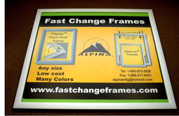
Frame edges flipped down to cover banner edges, clamps and mounting holes. Banner looks beautiful !